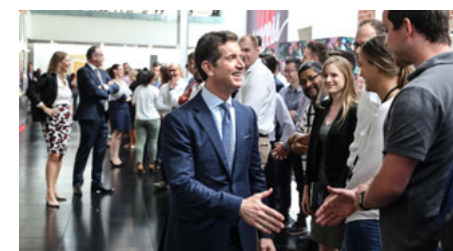
Alex Gorsky meeting with employees on his visit to Australia.

To ensure we're always investing for the future and keeping the long-term view, we're participating in important initiatives like the Embankment Project for Inclusive Capitalism, CECF's Strategic Investor Initiative and the U.S. Business Roundtable. With these expert partners, we're helping to shift the conversation in the financial markets toward a long-term view and measurement of the value to society that a business like ours creates.